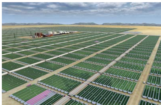
One view of the future – large scale, multiple raceway algae pond system